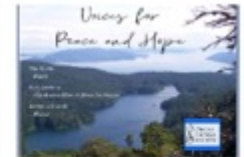
Orcas Choral Society: Voices for Peace and Hope Saturday, Apr 15, 2023 4:15 at 7:00 pm; 4:15 at 2:00 pm Orcas Center 917 Mt Baker Rd, Eastsound, WA 98245