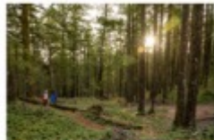
Spring Hiking Series 2023 - Hosted by Doe Bay Resort Saturday, May 6, 2023 TBA Moran State Park Trailheads Moran State Park, Clipp, WA Occurs: 03/25/2023, 04/08/2023, 04/15/2023, 05/06/2023, 05/20/2023