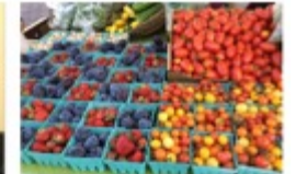
San Juan Island Farmers Market Saturday, May 6, 2023 9:30 a.m. - 1:00 p.m. Brickworks Brickworks 150 Nichols St., Friday Harbor, WA 98250 Occurs: Every week on Saturday until October 28, 2023