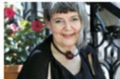
Salish Sea Early Music Festival - Orcas Island Performances Wednesday, May 10, 2023 6:00 pm Orcas Adventist Fellowship Church 107 Enchanted Forest Road, Eastsound, WA 98245 Occurs: 03/08/2023, 03/29/2023, 05/19/2023, 05/04/2023, 06/04/2023