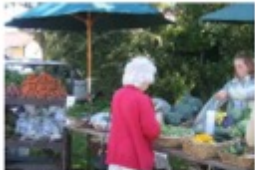
Lopez Island Farmers Market Saturday, Jun 3, 2023 Saturday, 10:00 a.m. - 2:00 p.m. Lopez Village Rd, Lopez Island, 98261 Occurs: Every week on Saturday until September 16, 2023