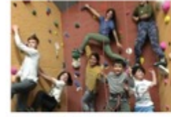
Youth Classes - Climb San Juan Tuesday, Jun 6, 2023 3:00 - 4:30 on Tuesdays, 2:00 - 3:30 on Wednesdays Climb San Juan 327 Argyle Avenue, PO Box 1280, Friday Harbor, WA 98250 Occurs: Every week on Tuesday Wednesday, until December 27, 2023