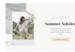
Summer Solstice Retreat: June 23-25, 2023 Friday, Jun 23, 2023 June 23-25, 2023 Friday Harbor, San Juan Island Friday Harbor, WA 98250