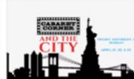
Cabaret Corner and the City Friday, Apr 21, 2023 Doors @ 7:00 pm, Show @ 7:30 pm Studio Jamm 15 2nd St. N., Friday Harbor, WA 98250 Occurs: 04/21/2023, 04/22/2023, 04/23/2023