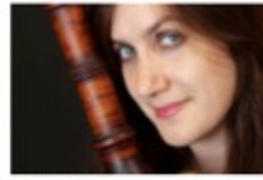
Salish Sea Early Music Festival - San Juan Island Performances Wednesday, Jun 21, 2023 See Description Brickworks (Except May 1st) 150 Nichols Street (former May 1st, Friday Harbor, WA 98250) Occurs: 03/11/2023, 04/01/2023, 05/01/2023, 05/06/2023, 05/21/2023, 06/21/2023