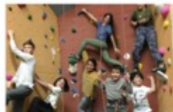
Youth Classes - Climb San Juan Tuesday, May 2, 2023 3:00 - 4:30 on Tuesdays, 2:00 - 3:30 on Wednesdays Climb San Juan 327 Argyle Avenue, PO Box 1280, Friday Harbor, WA 98250 Occurs: Every week on Tuesday Wednesday, until December 27, 2023