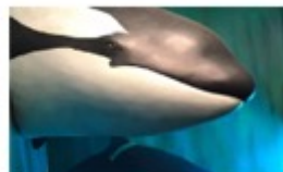
Marine Naturalist Training Program Tuesday, Apr 18, 2023 1:00 pm Virtual Presentations & In-Person Field Trips Friday Harbor, WA 98250