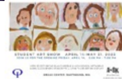
APOLK and High School Student Art Show Friday, Apr 14, 2023 5:00 pm-7:00 pm Orcas Center 917 Mount Baker Road, Eastsound, WA 98245