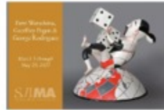
Spring 2023 Exhibitions Monday, May 1, 2023 11:00 a.m. - 5:00 p.m. San Juan Islands Museum of Art 540 Spring Street, Friday Harbor, WA 98250 Occurs: Every week on Sunday Monday, Friday, Saturday, until May 26, 2023