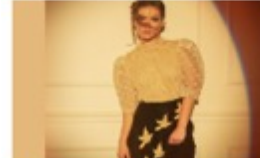
Nella Wednesday, Apr 19, 2023 7:00 pm Orcas Center 917 Mt Baker Road, Eastsound, WA 98245