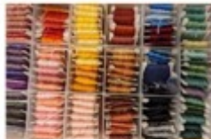
Drop-in Creative Mending Monday, May 8, 2023 6:00 pm Alchemy Art Center 1255 Wild Rd, Friday Harbor, WA 98250 Occurs: The Second Monday of every 1 month(s) until February 12, 2024