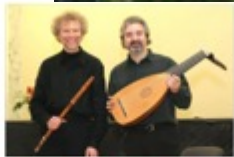
Salish Sea Early Music Festival - Lopez Island Performances Saturday, Apr 1, 2023 See Description Grace Church 70 Sunset Lane, Lopez, WA 98261 Occurs: 03/11/2023, 04/01/2023, 05/06/2023, 05/21/2023, 06/24/2023