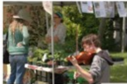
Orcas Island Farmers Market Saturday, Jun 3, 2023 10:00 am - 2:00 pm Eastsound Village Green Eastsound Village Green, Eastsound, 98245 Occurs: Every week on Saturday until September 30, 2023