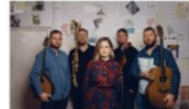
DAIMH in Concert Thursday, May 11, 2023 7:00 pm Lopez Center for Community and the Arts 204 Village Rd, Lopez Island, WA 98261