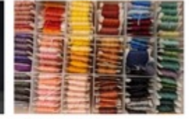
Drop-in Creative Mending Monday, Jun 12, 2023 6:00 pm Alchemy Art Center 1255 Wild Rd, Friday Harbor, WA 98250 Occurs: The Second Monday of every 1 month(s) until February 12, 2024