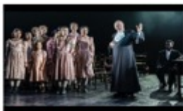
The Crucible (NT Live) - On Screen at Orcas Center Saturday, Apr 15, 2023 12:00 pm Orcas Center 917 Mt Baker Road, Eastsound, WA 98245