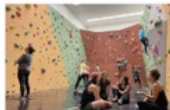
Ladies Night at Climb San Juan Wednesday, May 3, 2023 6:30 pm - 8:30 pm Climb San Juan 327 Argyle Ave, Friday Harbor, WA 98250 Occurs: Every 2 weeks on Wednesday until December 27, 2023