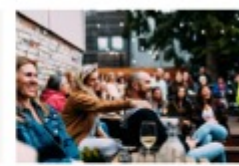
Comedy Shows at Madrone Cellars Saturday, Jun 24, 2023 7:00 pm Madrone Cellars & Ciders Tasting Room 40 First St, Friday Harbor, WA 98250 Occurs: 06/24/2023, 07/08/2023, 07/29/2023, 08/12/2023, 09/09/2023

Note: For more information on times and dates visit the San Juan Islands Visitors Bureau website —> https://www.visitsanjuans.com/events