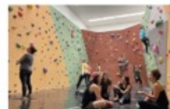
Ladies Night at Climb San Juan Wednesday, Apr 5, 2023 6:30 pm - 8:30 pm Climb San Juan 327 Argyle Ave, Friday Harbor, WA 98250 Occurs: Every 2 weeks on Wednesday until December 27, 2023