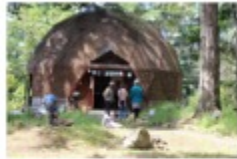
Drop-in Figure Drawing Monday, May 1, 2023 6:00 pm Alchemy Art Center 1255 Wild Rd, Friday Harbor, WA 98250 Occurs: The First Monday of every 1 month(s) until February 05, 2024