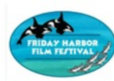
Friday Harbor Film Fest: Best of the Best 2023 Friday, Jun 23, 2023 7:30 pm San Juan Island Library or the San Juan Island Grange See Schedule, Friday Harbor, WA 98250 Occurs: 03/10/2023, 04/14/2023, 06/23/2023, 07/21/2023, 08/11/2023, 09/08/2023