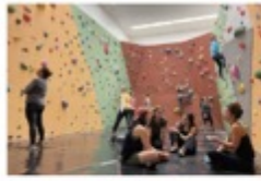
Ladies Night at Climb San Juan Wednesday, Jun 14, 2023 6:30 pm - 8:30 pm Climb San Juan 327 Argyle Ave, Friday Harbor, WA 98250 Occurs: Every 2 weeks on Wednesday until December 27, 2023