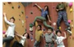
Youth Classes - Climb San Juan Tuesday, Apr 4, 2023 2:00 - 4:30 on Tuesdays, 2:00 - 3:30 on Wednesdays Climb San Juan 327 Argyle Avenue, PO Box 1280, Friday Harbor, WA 98250 Occurs: Every week on Tuesday Wednesday, until December 27, 2023