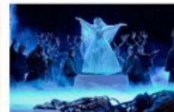
Falstaff (Met Opera) Saturday, May 6, 2023 12:00 pm Orcas Center 917 Mt Baker Road, Eastsound, WA 98245