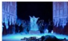
The Metropolitan Opera HD: Falstaff Saturday, Apr 15, 2023 1:00 pm San Juan Community Theatre 100 2nd St N, Friday Harbor, WA 98250