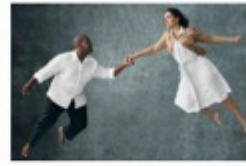
Die Zauberflöte (The Magic Flute - Met Opera) Saturday, Jun 17, 2023 12:00 pm Orcas Center 917 Mt Baker Road, Eastsound, WA 98245