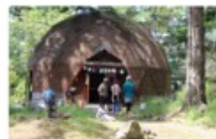
Drop-in Figure Drawing Monday, Apr 3, 2023 6:00 pm Alchemy Art Center 1255 Wold Rd, Friday Harbor, WA 98250 Occurs: The First Monday of every 1 month(s) until February 05, 2024