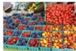
San Juan Island Farmers Market Saturday, Jun 3, 2023 9:30 a.m. - 1:00 p.m. Brickworks Brickworks, 150 Nichols St., Friday Harbor, 98250 Occurs: Every week on Saturday until October 28, 2023