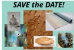
SAVE the DATE! San Juan Island Artists' Studio Tour Saturday, Jun 3, 2023 10:00 am - 5:00 pm San Juan Island, 98250 Occurs: 06/03/2023, 06/04/2023