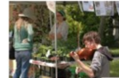
Orcas Island Farmers Market Saturday, May 6, 2023 10:00 am - 2:00 pm Eastsound Village Green Eastsound Village Green, Eastsound, WA 98245 Occurs: Every week on Saturday until September 30, 2023