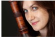
Salish Sea Early Music Festival - San Juan Island Performances Monday, May 1, 2023 See Description Brickworks (Except May 1st) 150 Nichols Street (Except May 1st), Friday Harbor, WA 98250 Occurs: 03/11/2023, 04/01/2023, 05/01/2023, 05/06/2023, 05/27/2023, 06/21/2023