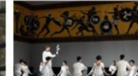
Der Rosenkavalier (Met Opera) Saturday, May 20, 2023 12:00 pm Orcas Center 917 Mt Baker Road, Eastsound, WA 98245

Note: For more information on times and dates visit the San Juan Islands Visitors Bureau website —> https://www.visitsanjuans.com/events