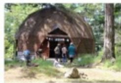
Drop-in Figure Drawing Monday, Jun 5, 2023 6:00 pm Alchemy Art Center 1255 Wild Rd, Friday Harbor, WA 98250 Occurs: The First Monday of every 1 month(s) until February 05, 2024