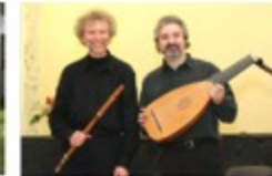
Salish Sea Early Music Festival - Lopez Island Performances Saturday, May 6, 2023 See Description Grace Church 70 Sunset Lane, Lopez, WA 98261 Occurs: 03/11/2023, 04/01/2023, 05/06/2023, 05/27/2023, 06/24/2023