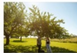
Winemaker's Lunch Tuesday, Jun 6, 2023 12:00 - 2:00 pm Madrone Winery 862 Valley Farms Road, Friday Harbor, WA 98250