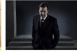
Don Giovanni (Met Opera) Saturday, Jun 10, 2023 12:00 pm Orcas Center 917 Mt Baker Road, Eastsound, WA 98245