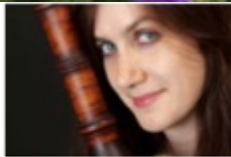
Salish Sea Early Music Festival - San Juan Island Performances Saturday, Apr 1, 2023 See Description Brickworks (Except May 1st) 150 Nichols Street (Except May 1st, Friday Harbor, WA 98250) Occurs: 03/11/2023, 04/01/2023, 05/06/2023, 05/21/2023, 06/24/2023