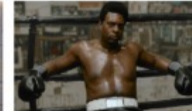
Champion (Met Opera) Saturday, May 13, 2023 12:00 pm Orcas Center 917 Mt Baker Road, Eastsound, WA 98245