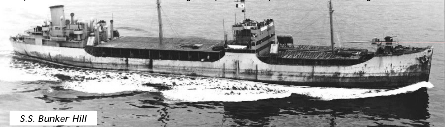
S.S. Bunker Hill

The dive operation underway now is by a firm called DCS Films ( dcsfilms.com ), which specializes in advanced technical diving and underwater photography. They are producing a documentary about the wreck, to add to their portfolio which includes extensive filming of airplane and ship wrecks in Lake Washington.