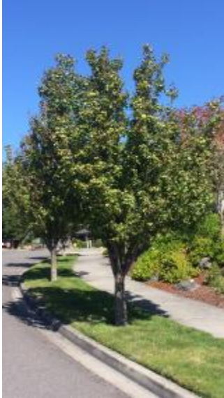
Diagram is NOT TO SCALE.